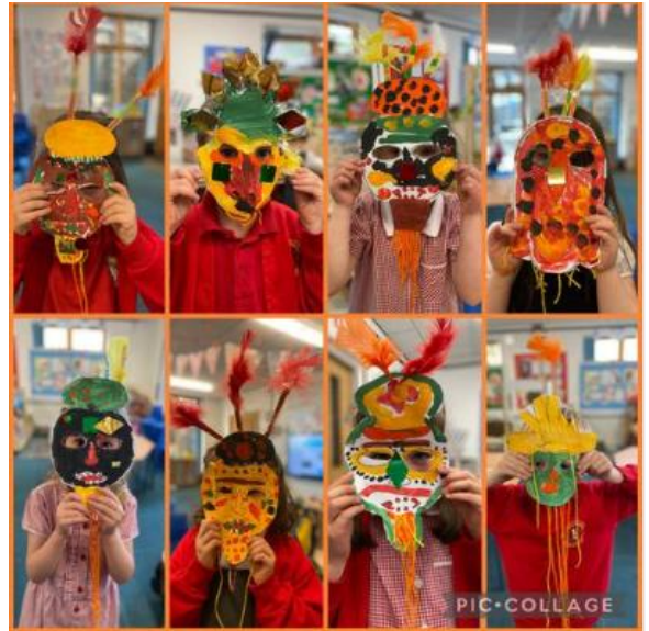
How fab are our finished Kenyan tribal masks?! We can't wait to put them on display ke