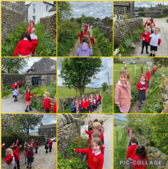
We had a lovely nature walk this afternoon hunting for a variety of trees and wild plants that we've been learning about in our Science 🌱🌸