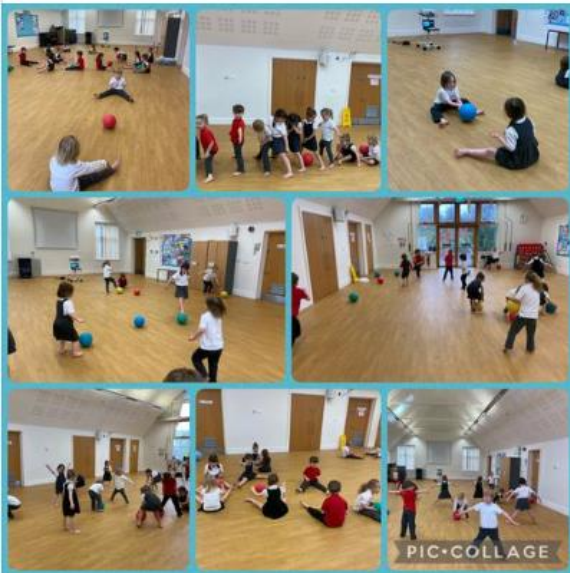
We've had a great first day back practicing our rolling skills in PE 🏀