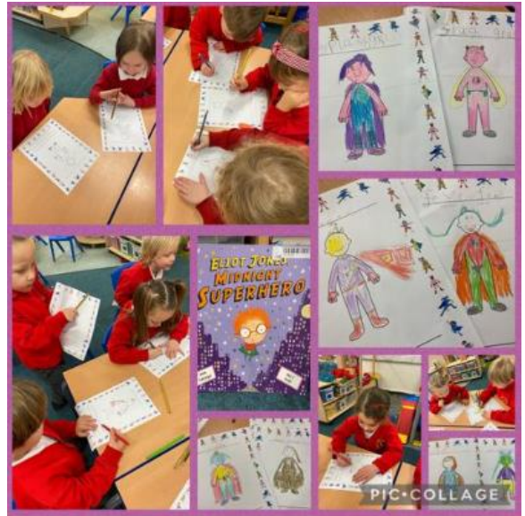
In our Literacy we've been reading 'Eliot Jones, Midnight Superhero'. We thought carefully about different superheroes, their magic powers and their costumes before designing one of our own. We made sure that our costumes and logos matched our special powers and names! We will be using our newly created superheroes to create our own stories about them over the coming weeks.