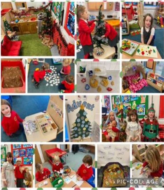
Christmas has officially arrived in Acorn Class 🎄 Here are some of the festive activities that we've already been enjoying around our classroom!