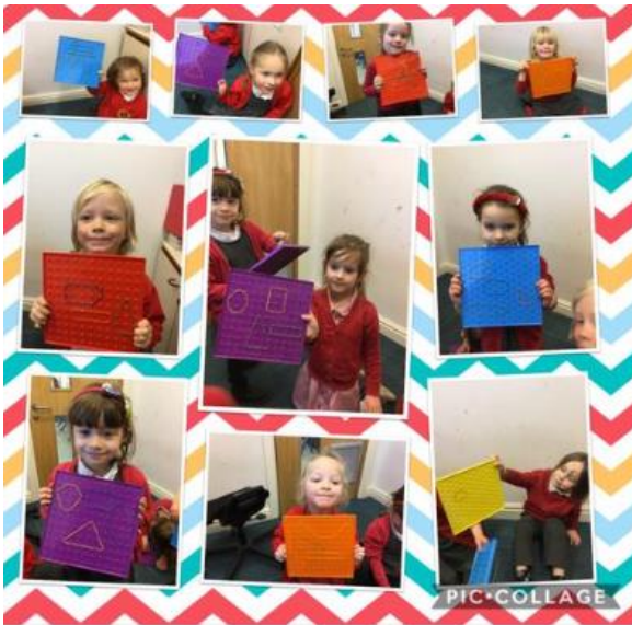
Our Reception have been exploring the position and rotation of 2D shapes. They have had GREAT fun (like, really... REALLY loved it!) creating different shapes using elastic bands on geo boards, also good for our fine motor skills! I will be putting these in provision so they can continue to explore the different shapes they can make.