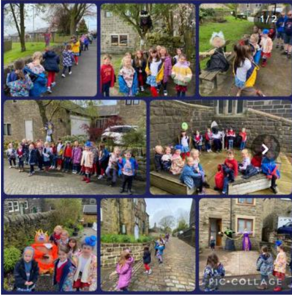
What a fabulous day commemorating King Charles' Coronation as we had a great morning out and about on our royal scarecrow walk before coming back to enjoy our family picnic, Maypole performance and Coronation song!