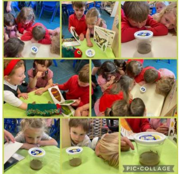
We are VERY excited as our very little special guests have arrived in Acorn Class today! We can't wait to look after them and watch them develop and grow into beautiful butterflies 🦋🦋