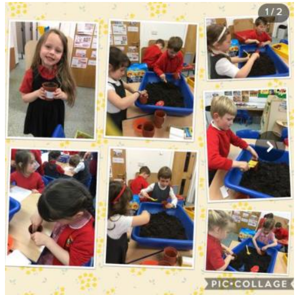
Our science this half term is all about plants. This week we've started by looking at the different types and parts of plants as well as what they need in order to grow well. We then all enjoyed planting our own sunflower seeds and we can't wait to watch them grow 🌻