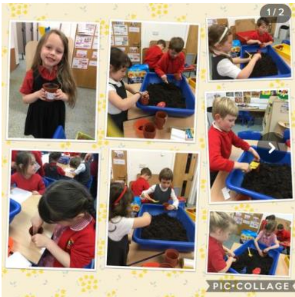
Our science this half term is all about plants. This week we've started by looking at the different types and parts of plants as well as what they need in order to grow well. We then all enjoyed planting our own sunflower seeds and we can't wait to watch them grow 🌻