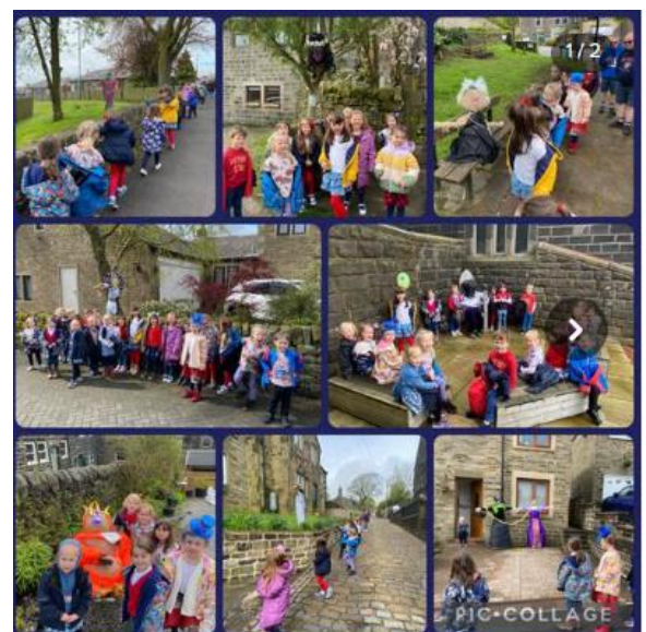
What a fabulous day commemorating King Charles' Coronation 🏰 We had a great morning out and about on our royal scarecrow walk before coming back to enjoy our family picnic, Maypole performance and Coronation song!