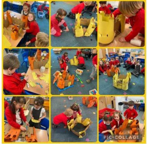
We've had great fun in our DT lessons finishing off our castles. We've worked in our groups to make sure we have included as many castle features as possible, including; battlements, loop holes, drawbridges, towers, portcullis', flags and gatehouses. Once finished, we have enjoyed playing with our castles, using blue building blocks to create moats and having battles against each other using our previously made catapults! 🏰