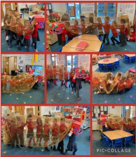
We had great fun doing our Chinese dragon dancing this morning 🐉