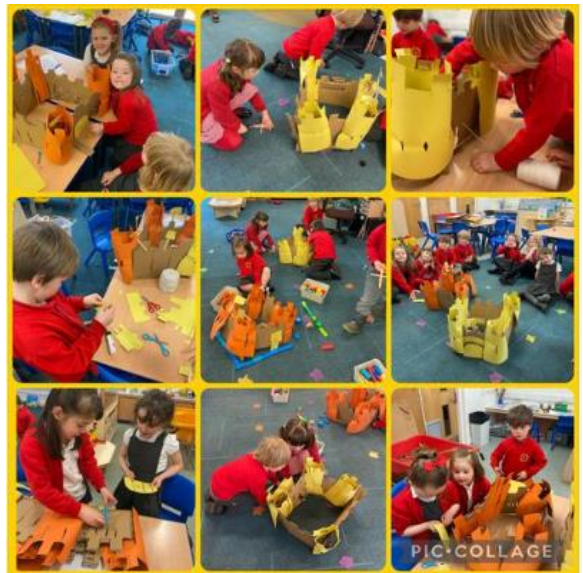
We've had great fun in our DT lessons finishing off our castles. We've worked in our groups to make sure we have included as many castle features as possible, including: battlements, loop holes, drawbridges, towers, portcullis', flags and gatehouses. Once finished, we have enjoyed playing with our castles, using blue building blocks to create moats and having battles against each other using our previously made catapults! 🏰